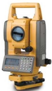
GTS-100N Series Construction Total Stations